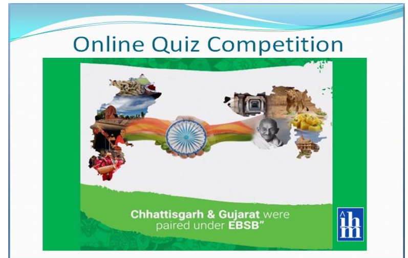
Online Quiz on paired States of Chhattisgarh and Gujarat (Pic 4)