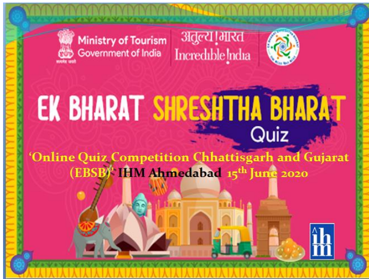
Online Quiz Competition of Chhattisgarh and Gujarat (Pic 1)